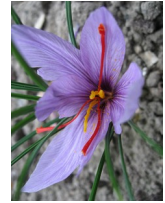
Crocus sativus flower

Saffron: The world's most expensive spice (price of gold!) consists of the dried red stigmas of the Crocus sativus flower. Each flower has 2-3 stigmas ( see picture ). To produce 1 kg of saffron around 80 000 flowers (2 soccer fields!!!) are needed. Saffron is therefore often diluted with cheap substitutes.