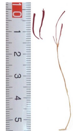
Saffron stigmas without and with styles [cm]

Efficient usage: For maximal colour, flavour and fragrance saffron should be pulverised prior to its use. The resulting powder can be dissolved in little warm (not hot) water before its addition to any dishes. Saffron powder can also be kept for weeks and months before any noticeably degradation - provided it is stored in the right way.